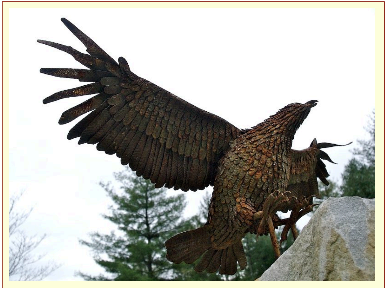
The Golden Eagle sculpture is on the front lawn of the TC Arts Council Building