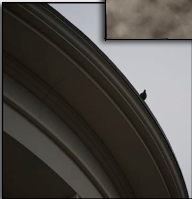
↓ Ron Rutherford ↓

new opportunity to hone the photographer's craft-seeing everyday, mundane objects in a whole new light, or lack of same, found objects, trash to some, that